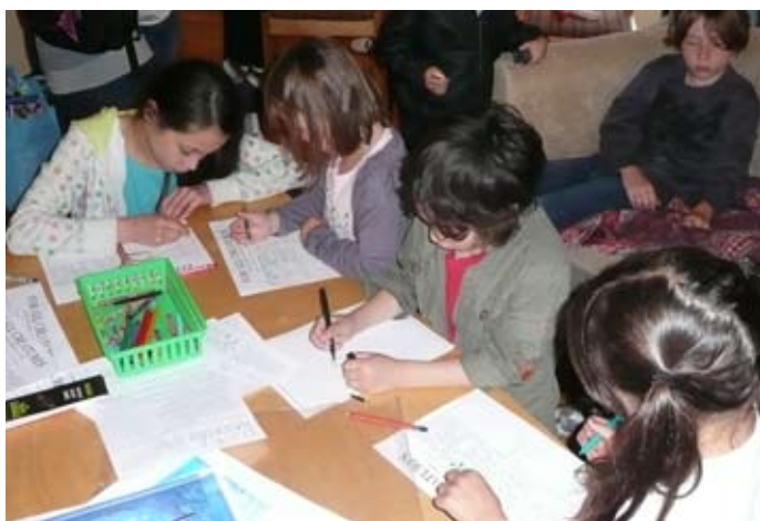
All quiet while we work on our activity sheets!